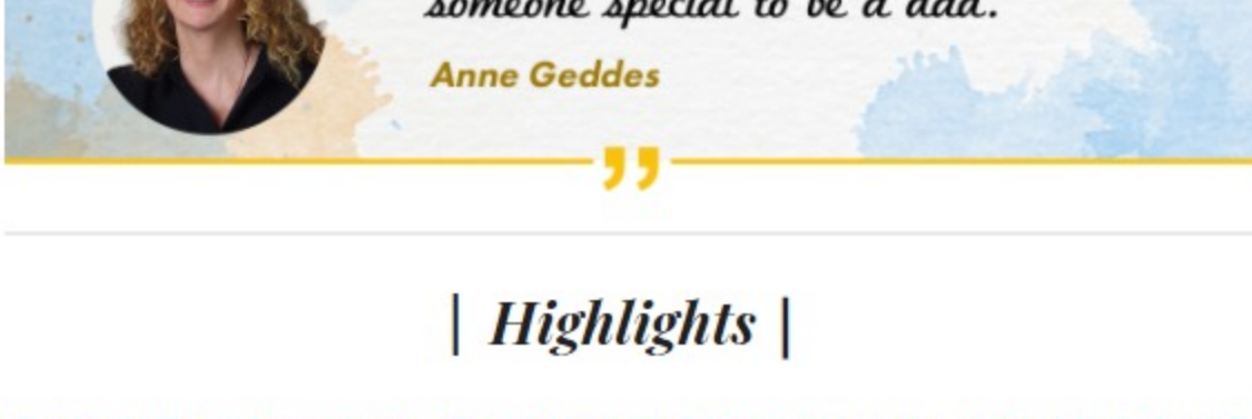
Figure out Fatherhood >>>

Children with fathers who are deeply involved in raising them grow up to be happier, healthier and smarter. But the role which fathers play changes at different stages of their child's development, from infant to adult.